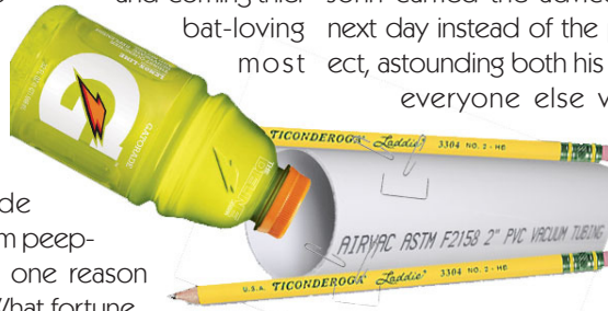
An artist's rendition of the device supposedly indicates a need for Gatorade to pass through the PVC. Tests are still being done, but with some difficulty since the volunteers can be hard to find.

Over the course of human history, we have always wished as a species to disappear - from view, that is. From "that guy" blending into the crowd to the embarrassed school boy who just wants to melt away into the floorboards; from the up-and-coming thief to the com-soldier, al-everyone has desired at some point to hide their face from peeping eyes for one reason or another. What fortune, then, that this recent discovery has popped out of nowhere to take its place in history.